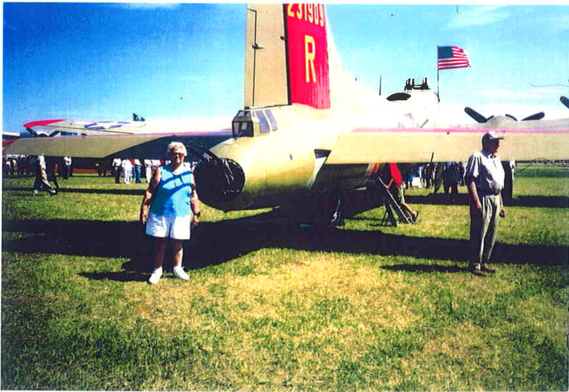
B-17 on display in July of 2001 at Palwaukee Airport. Mrs. Rogala stands near the tail gunner's combat position where her husband served in 50 missions.